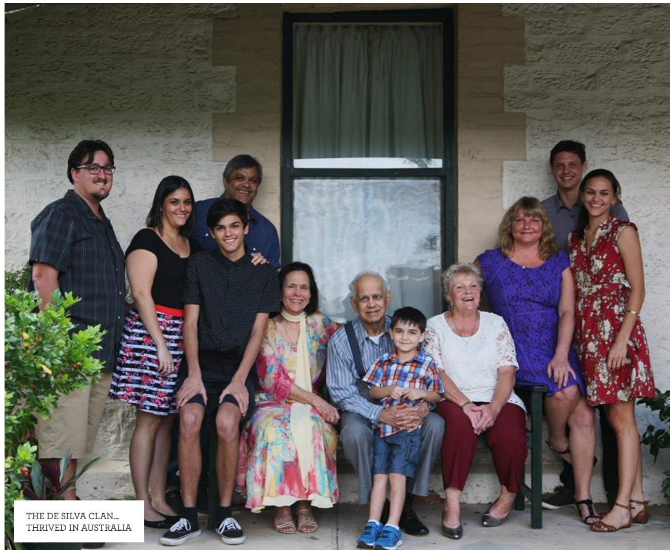
THE DE SILVA CLAN... THRIVED IN AUSTRALIA

His parents invested nearly all their earnings in buying a house and sending their children to private school.